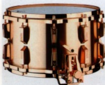
HLD 590 8" x 14" Bronze shell