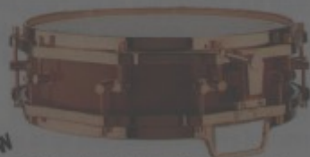
EHD 400 RM 4" x 14" Wood shell