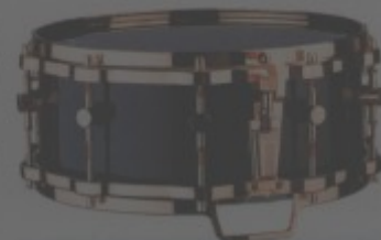
EHD 500 B 5 3/4" x 14" Wood shell