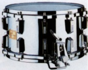
HLD 588 8" x 14" Metal shell