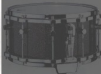
HD 700 BD 7" x 14" Wood shell