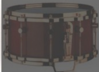
EHD 700 RM 7" x 14" Wood shell