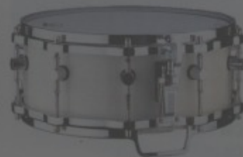
HD 500 CL 5 3/4" x 14" Wood shell