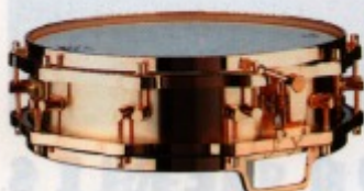
HLD 593 4" x 14" Bronze shell