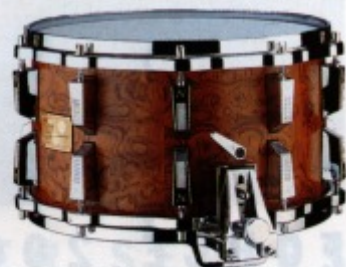
HLD 580 RH 8" x 14" Wood shell