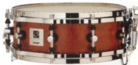
DS 1406 ML RH (African Bubinga)

The large selection of shell materials like wood, seamless ferromanganese steel, brass, and cast bronze offers perfect side-drums for every style and taste. A recently developed strainer, high-quality heads from the Sonor production-line and die-cast rims (on the 14" models) guarantee the remarkably consistent quality of Sonor snare drums.